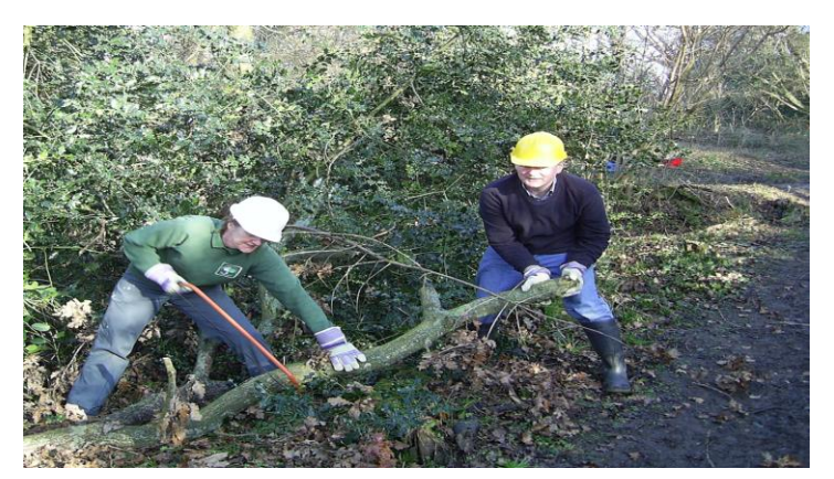
Volunteers clearing storm damage.

WORKDAYS:- work takes place between 10.00 & 1.00 on the second Sunday of every month. We meet at the main entrance to the wood shortly before 10.00. For safety reasons, we cannot allow children to participate in workdays.