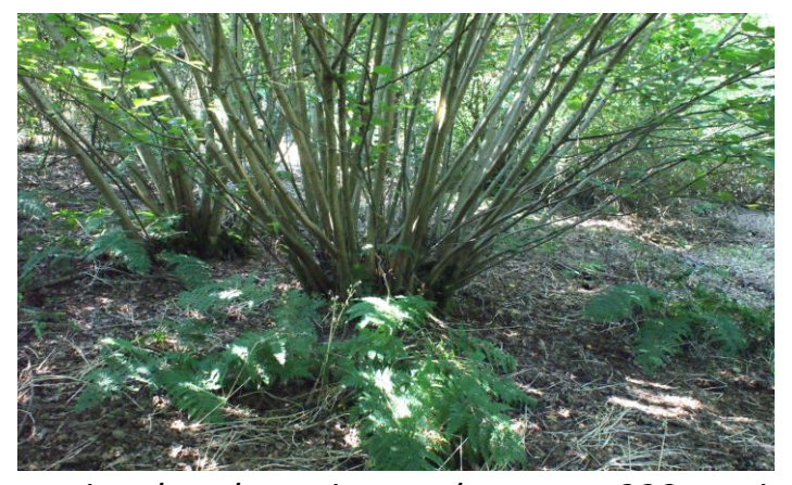
An ancient hazel coppice stool, approx. 330cm girth.

As the cycle of coppicing continues, each coppice stool grows wider, and eventually develops into a ring of live wood as the centre rots out. These rings become much larger than the tree would grow to be if left to grow naturally. A typical hazel left to grow as a tree will live for 60-70 years and reach a girth of around 80-100cm; compare that to the stool shown below!