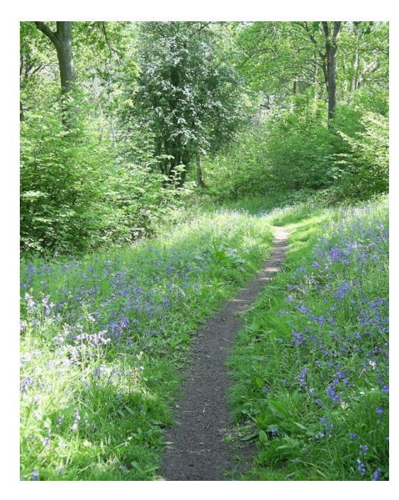
Bluebells adorn the wood in spring.

A small area of ancient woodland with a recorded history extending back for over 800 years. The wood has a diversity of plant and bird life which is only found in such old woodlands. Mortimore's Wood lies just one mile from the centre of the busy town of Chippenham, providing a haven of tranquillity from the bustle of modern life.