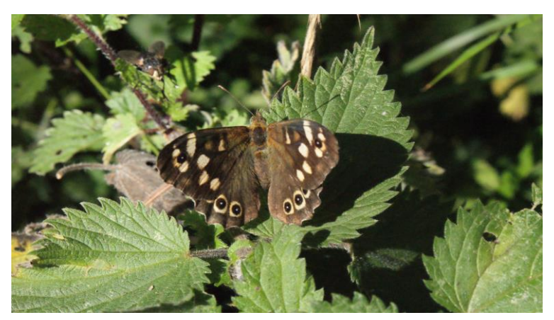
Speckled Wood butterfly.

In Mortimore's Wood, surveys have identified over 60 species of ground flora, a very high level of diversity, in the coppiced area. A number of these species, along with several species of tree, are associated only with ancient woodland and are known as indicator species . The proportion of these within the wood is one of the factors that influenced its designations as a County Wildlife Site and, in 2007, Local Nature Reserve. The total of trees is 16 species, which is an unusually large range for woodland of this type and size. Four of these are indicator species, three of which [Aspen, Crab Apple & Holly] are present in unusually high numbers.